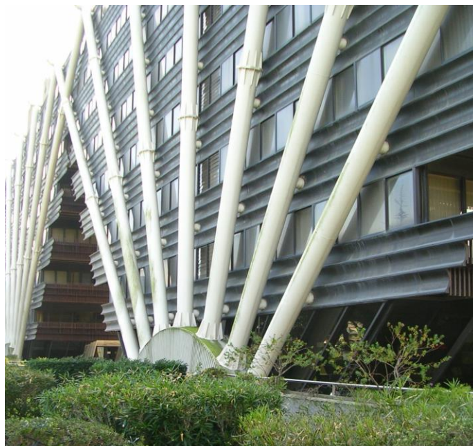
Figure 2 - Fire Protected External Steelwork. Project: Torri Esso – Rome, Architect: Julio Lafuente.