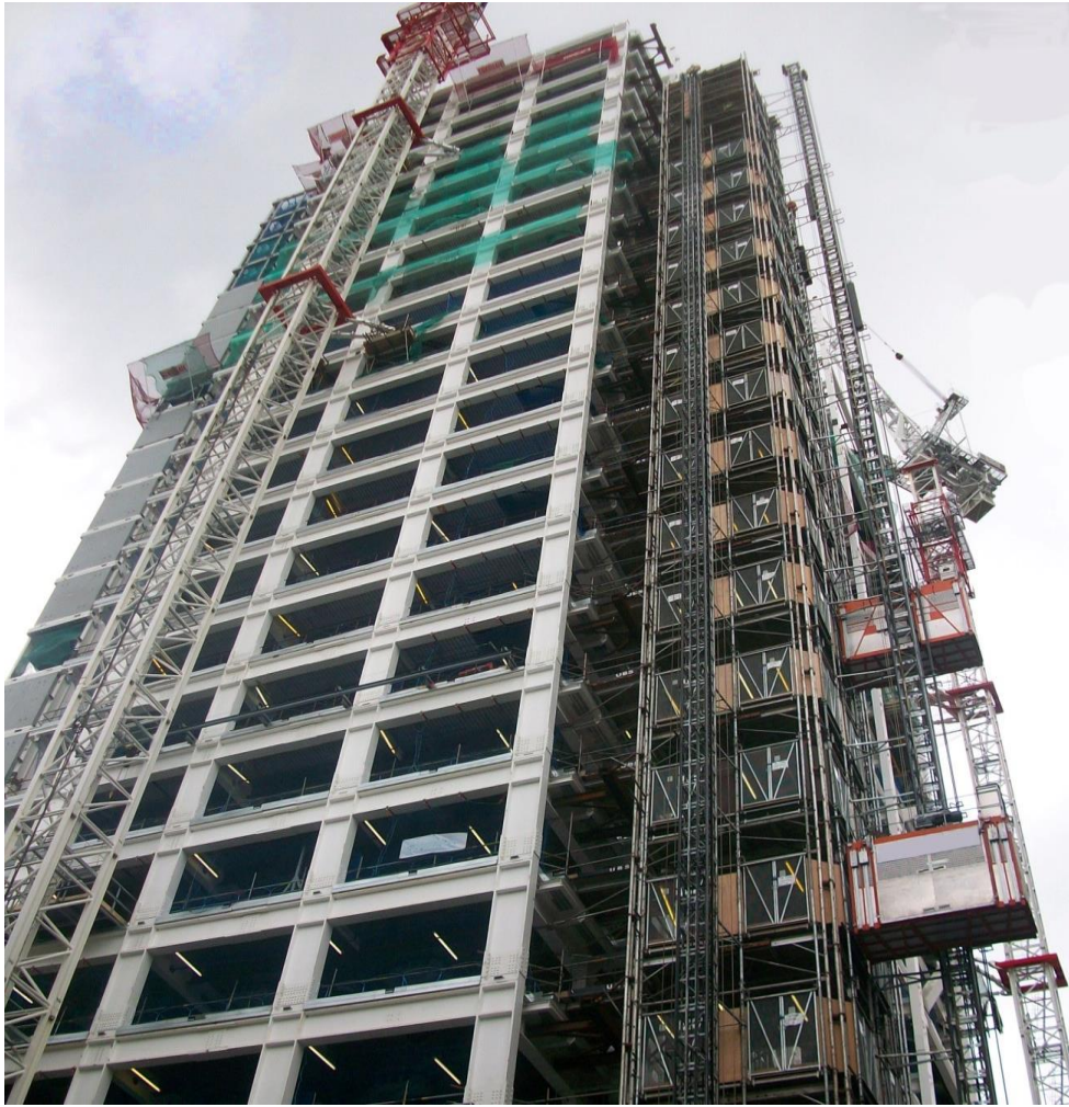
Figure 1 – Steelwork Fire Protected By Intumescent Coating System