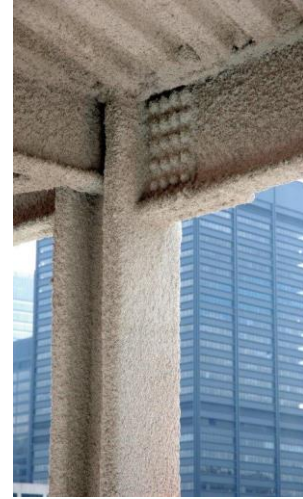
Figure 3 – Steelwork Fire Protected By SFRM Coating System

SFRMs are used to passively delay (or prevent) the failure of steel and the spalling of concrete in structures that are exposed to the high temperatures found during a fire. SFRMs thermally insulate the structural steel members and concrete to keep them below the temperatures that cause failure and / or spalling.