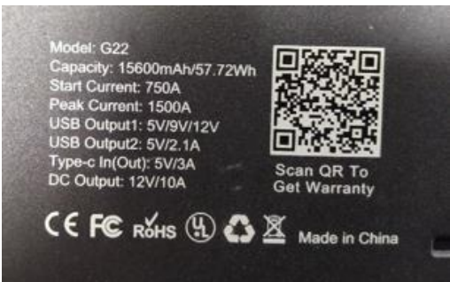
Model: BP101 Capacity: 21000mAh(77.7Wh) Start Current: 1100A Peak Current: 2200A