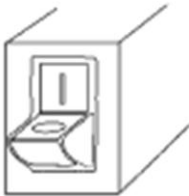
Switch in "ON" position

A straight up-and-down line marks the "ON" position of a switch. A circle marks the "OFF" position of a switch.