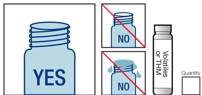
Volatile or THM Testing

Call 1.574.233.4777 or 1.800.332.4345 or visit us at www.ul.com/water UL, 110 S. Hill Street, South Bend, IN 46617